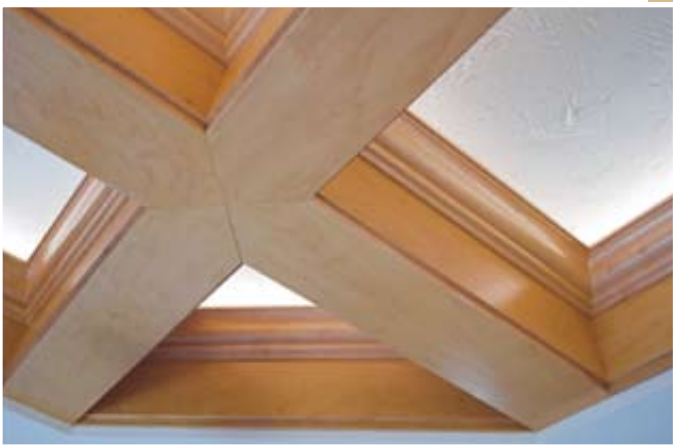
This elegant floating-beam coffered ceiling was created with Red Leaf™ crown moulding and veneer boards.